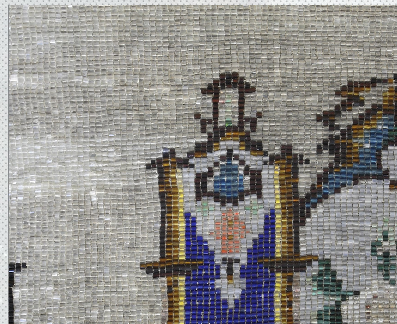
iii. 4. Fragment No. 1 of the antependium after restoration.