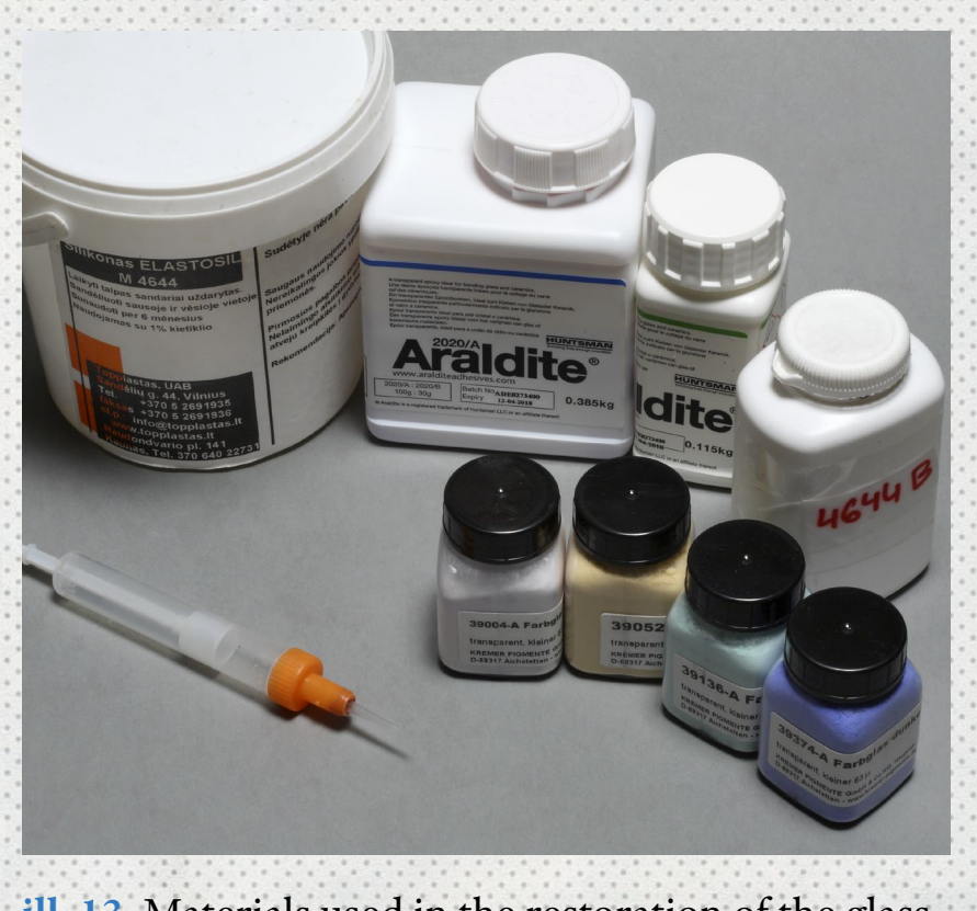
iii. 13. Materials used in the restoration of the glass beads.