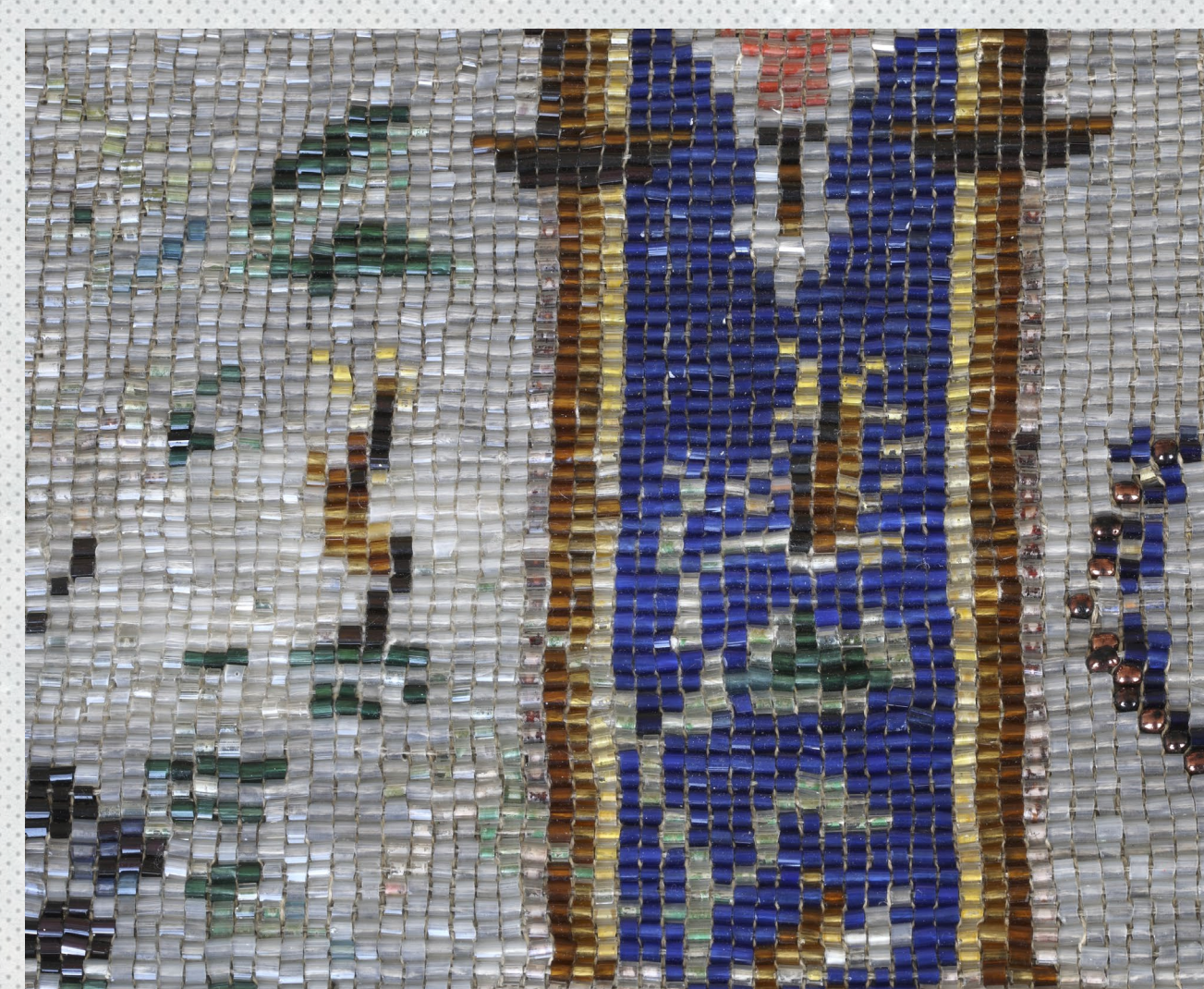
iii. 6. Fragment No. 2 of the antependium after restoration.