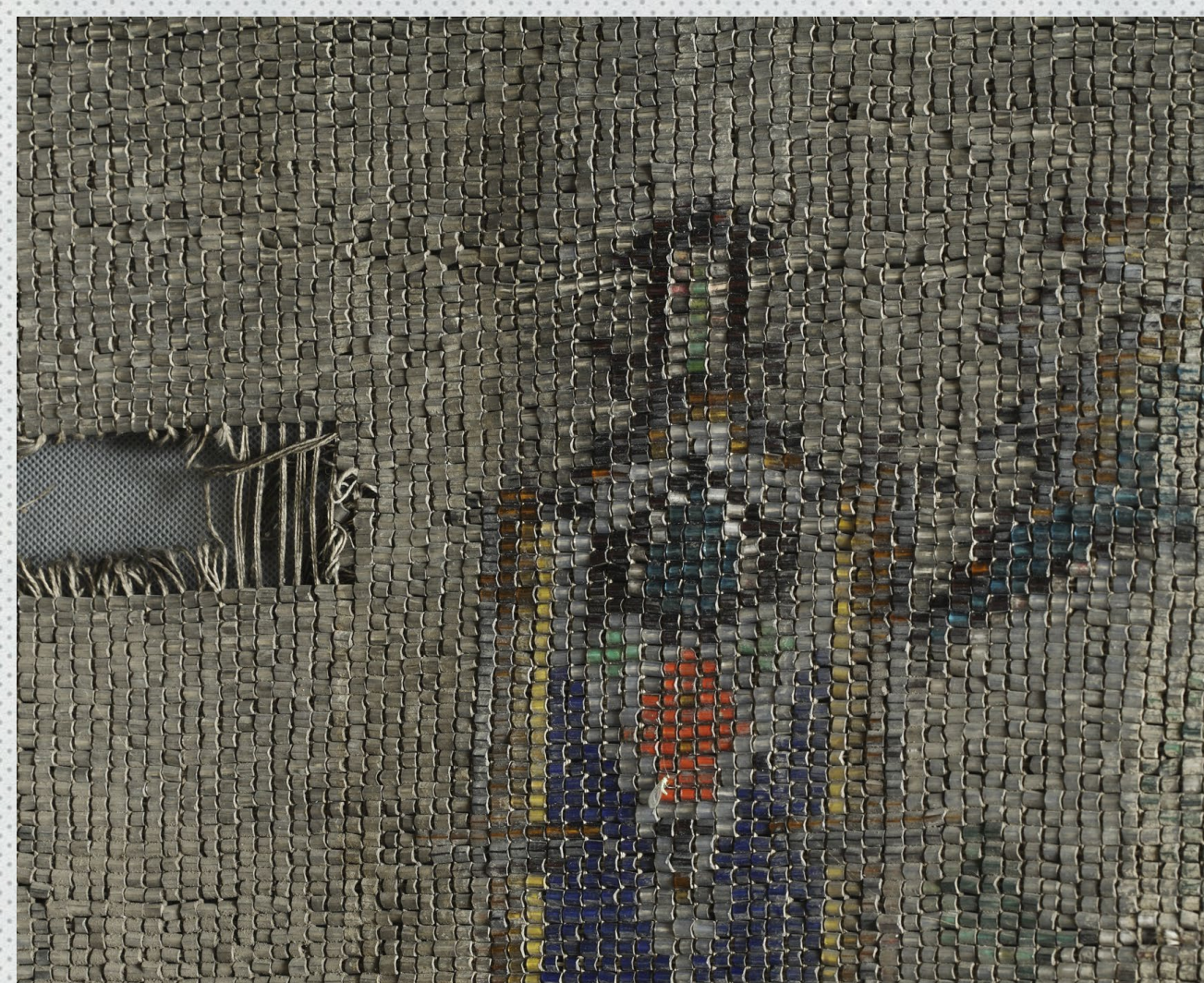
iii. 3. Fragment No. 1 of the antependium before restoration.