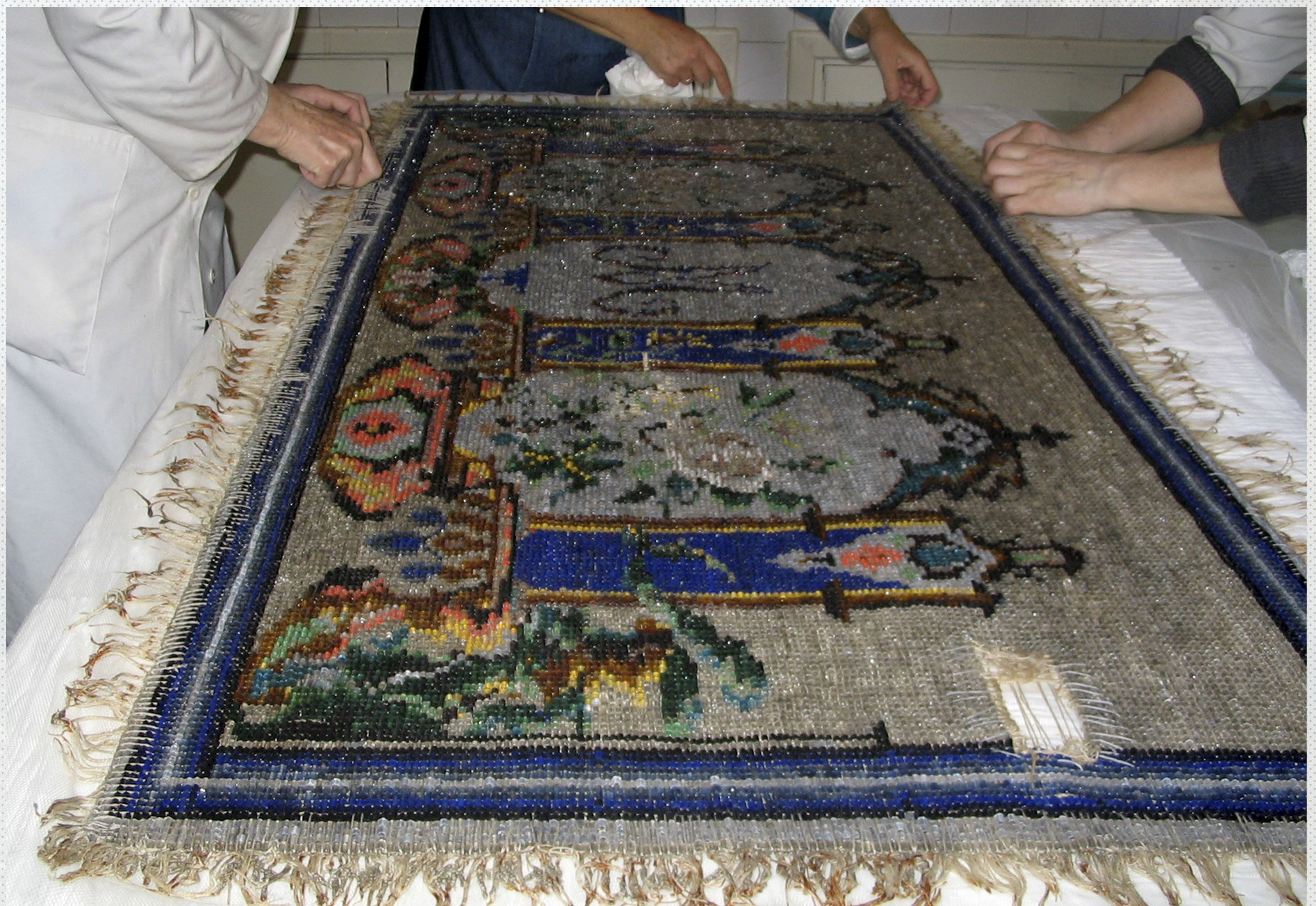
iii. 9. Antependium is prepared for drying.