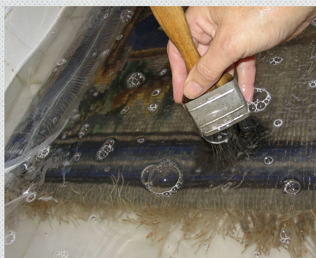
iii. 7. Wash of the antependium.