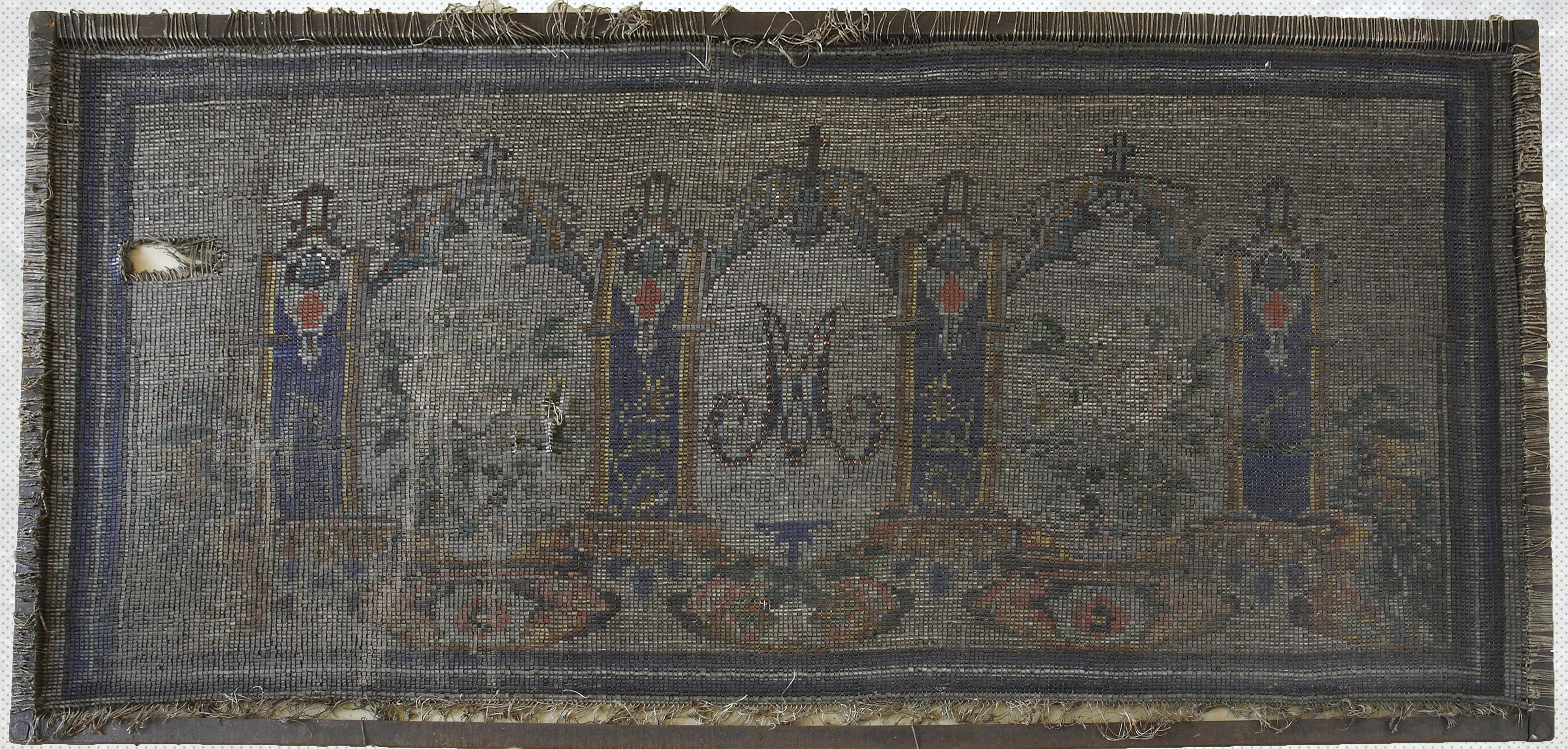
iii. 1. Antependium before restoration.

The restored antependium is ready for exposition.