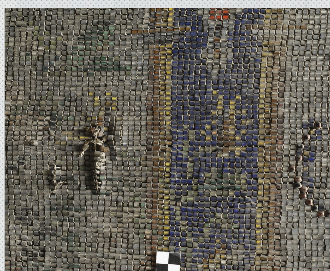
iii. 5. Fragment No. 2 of the antependium before restoration.