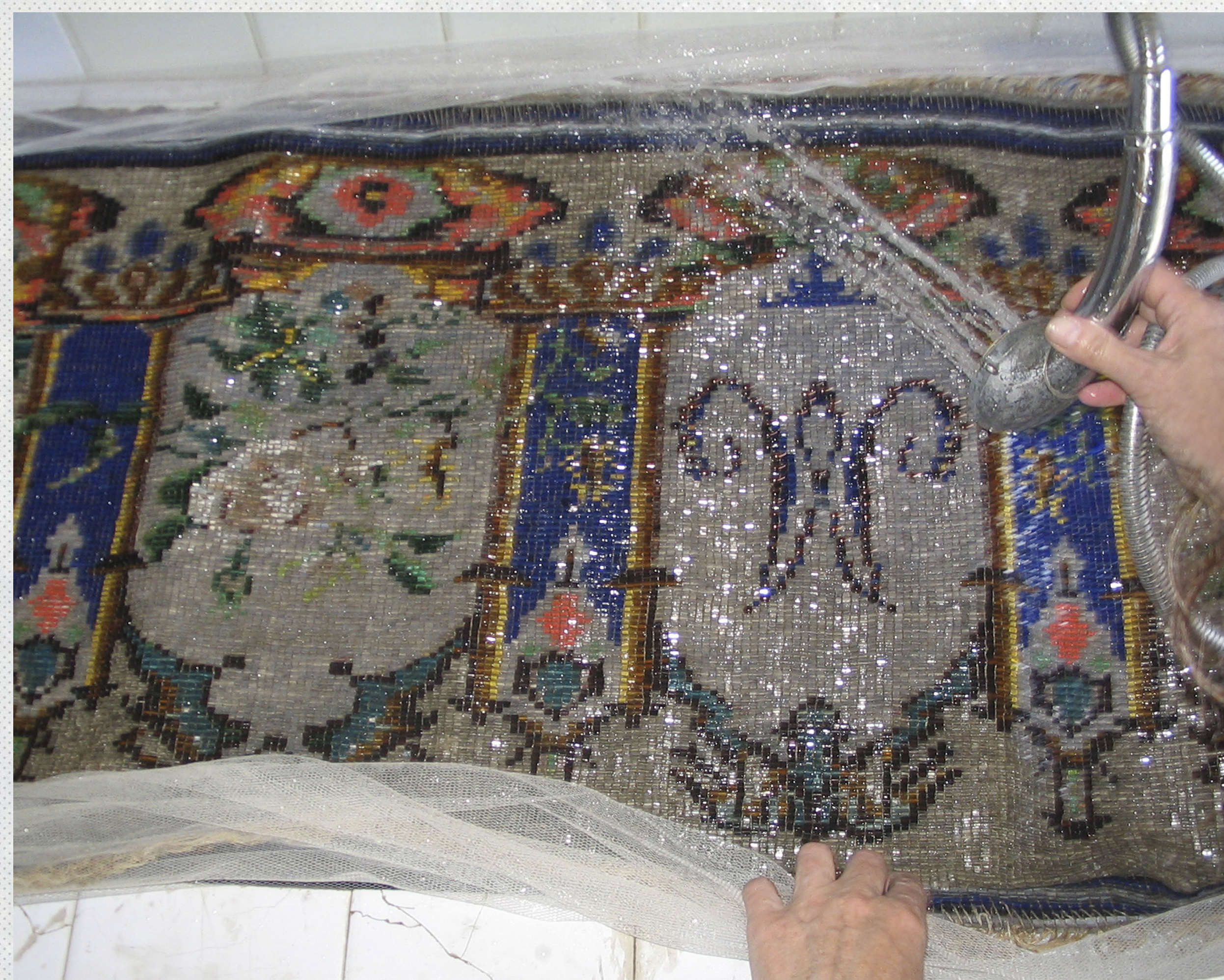
iii. 8. Rinse of the antependium.