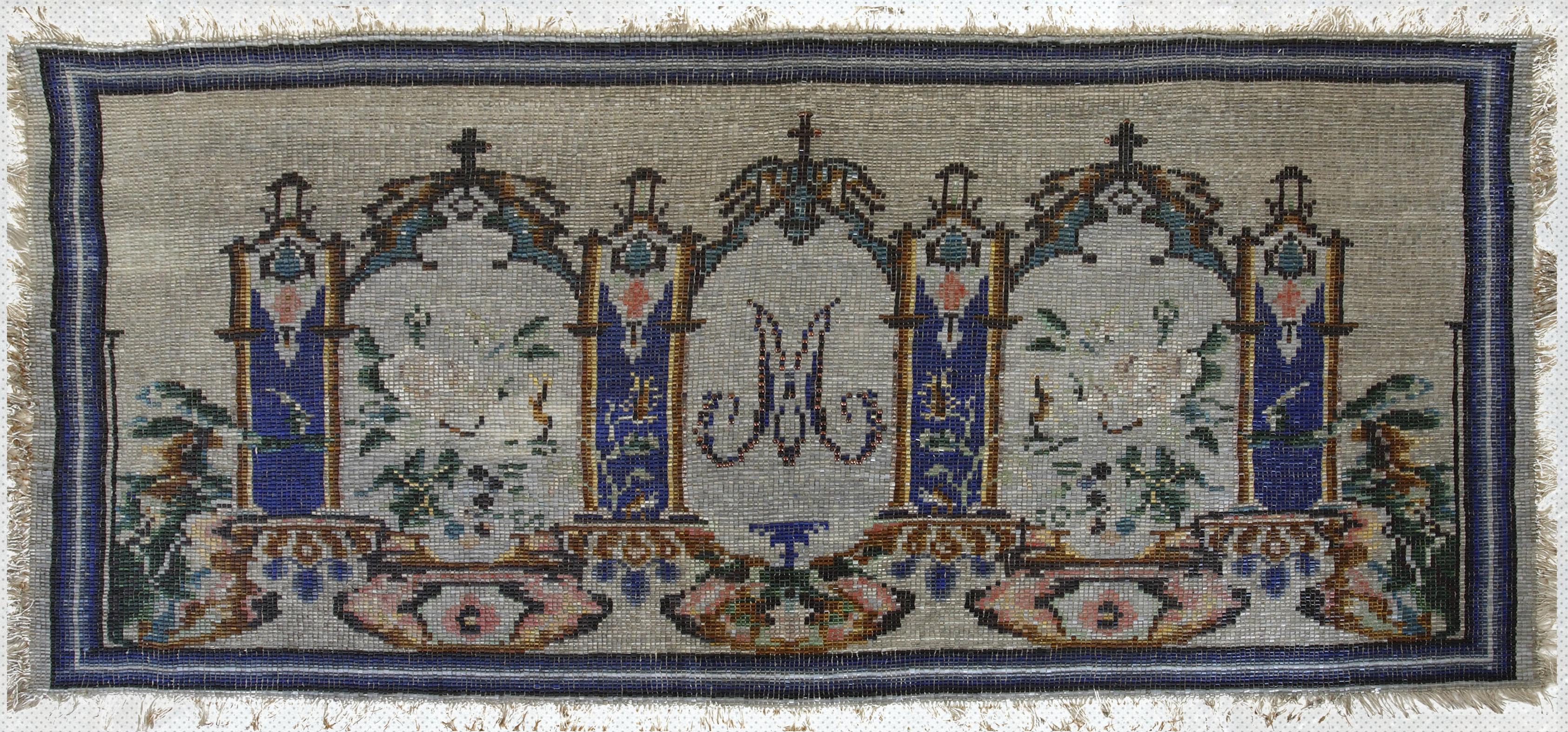
iii. 2. Antependium after restoration.