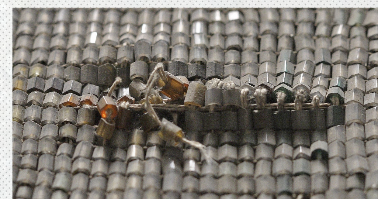
iii. 10. Glass beads before restoration.