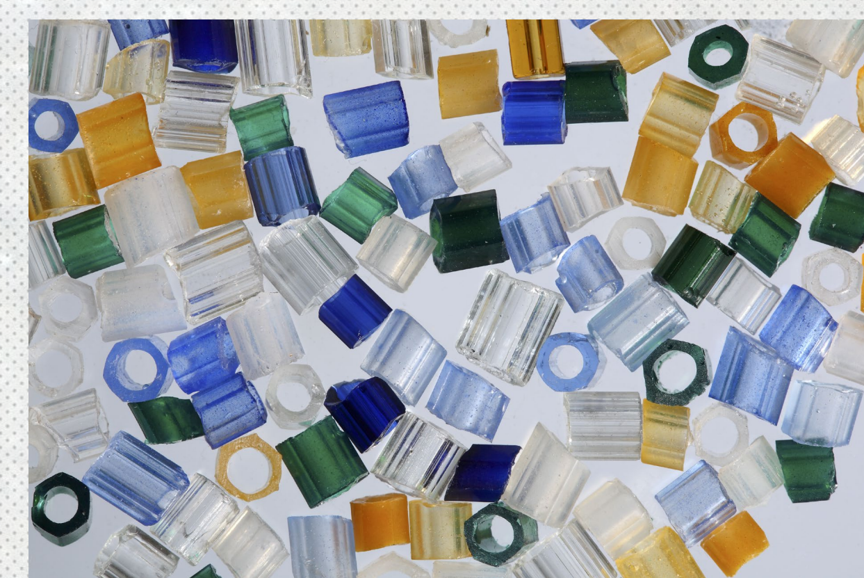
iii. 12. New beads moulded of epoxy resin colored with pigments.