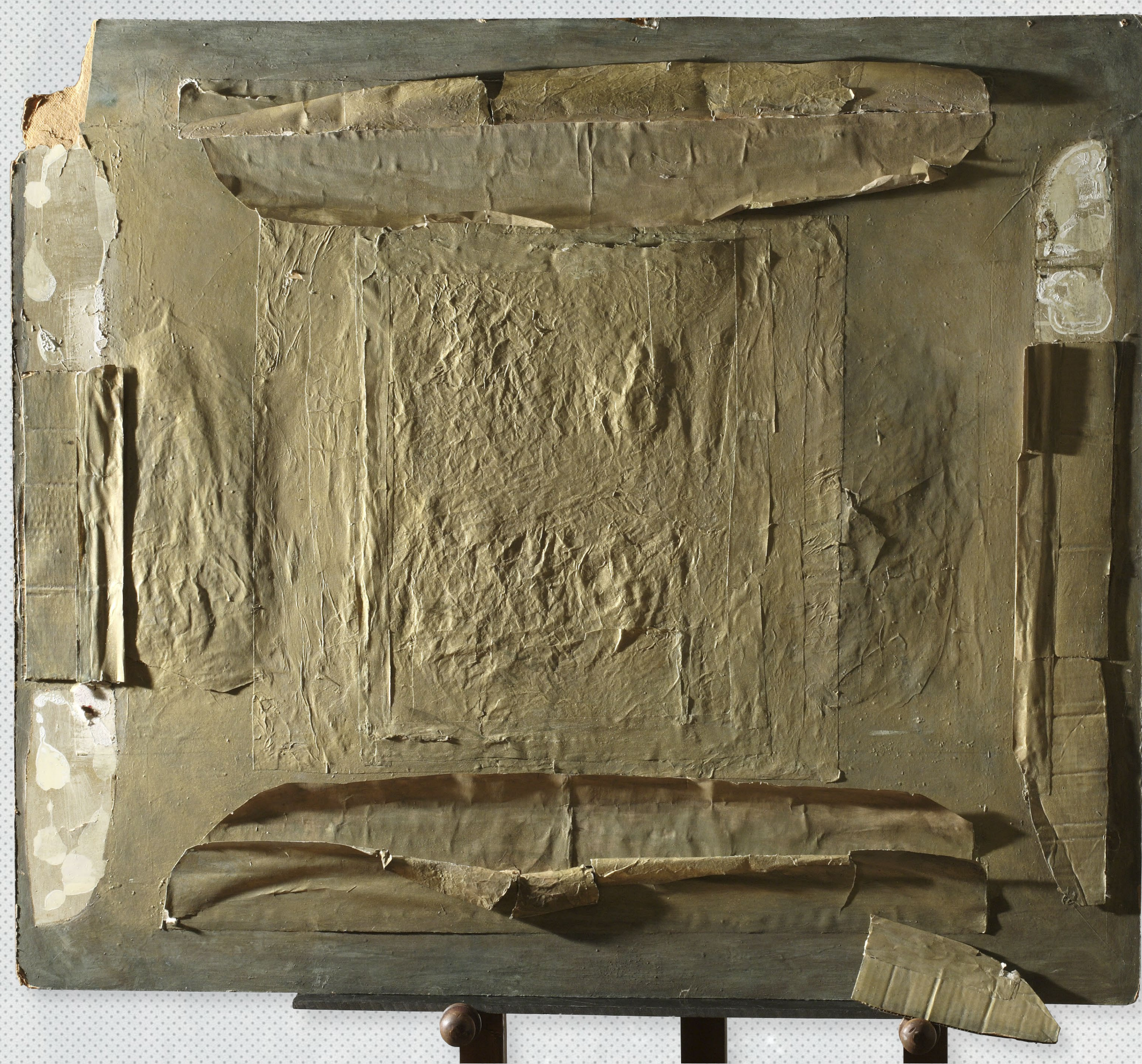
ill. 1. K. Zimblytė (KAZĖ). "Composition. I". Cardboard, paper, tempera, bronze paint, collage, 104 x 122 cm. Lithuanian Art Museum, inv. no. ED 170437. Collage before restoration.