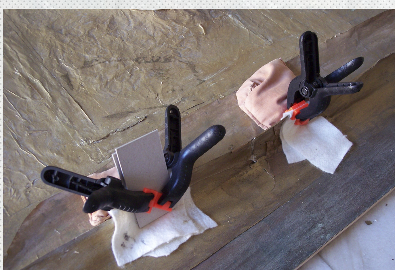
ill. 4. Fragments during the restoration. Glued spatial detail pressed locally by compressing small clips.