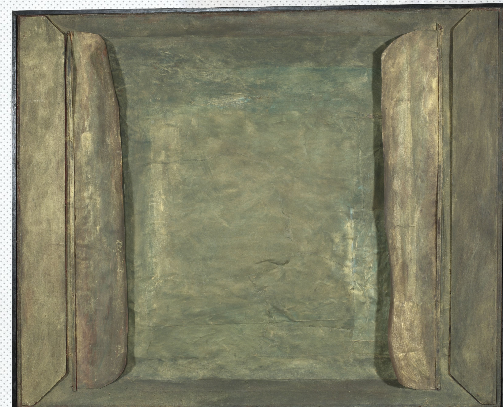
ill. 11. Collage after restoration.