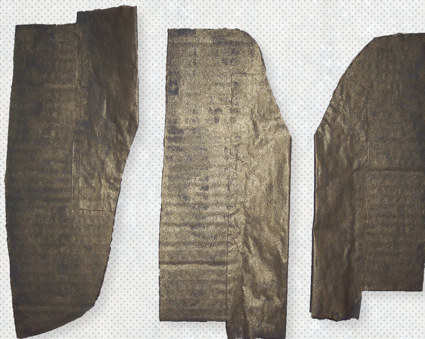
ill. 5. Creating of the missing details. Details made from corrugated cardboard, kraft paper, cut according to the shape of bronze unpainted area; tinted by tempera paint, mixed with bronze powder.