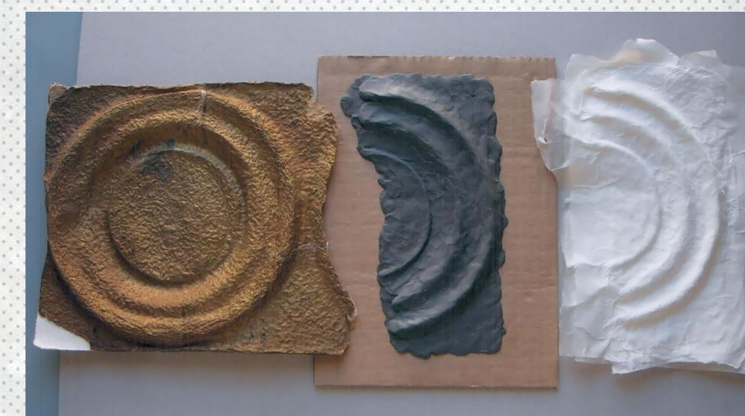
ill. 13. Creating of the detail of collage: it is formed from layers of paper glued together according to sculpted form of the plaster.