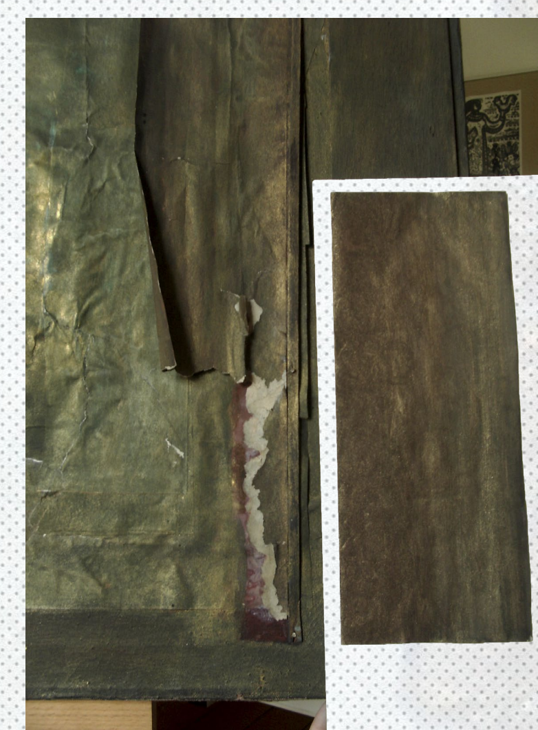
ill. 9. Fragment during the restoration. The missing part created from the thick and rigid paper; toned with tempera and watercolor paints mixed with bronze powder.