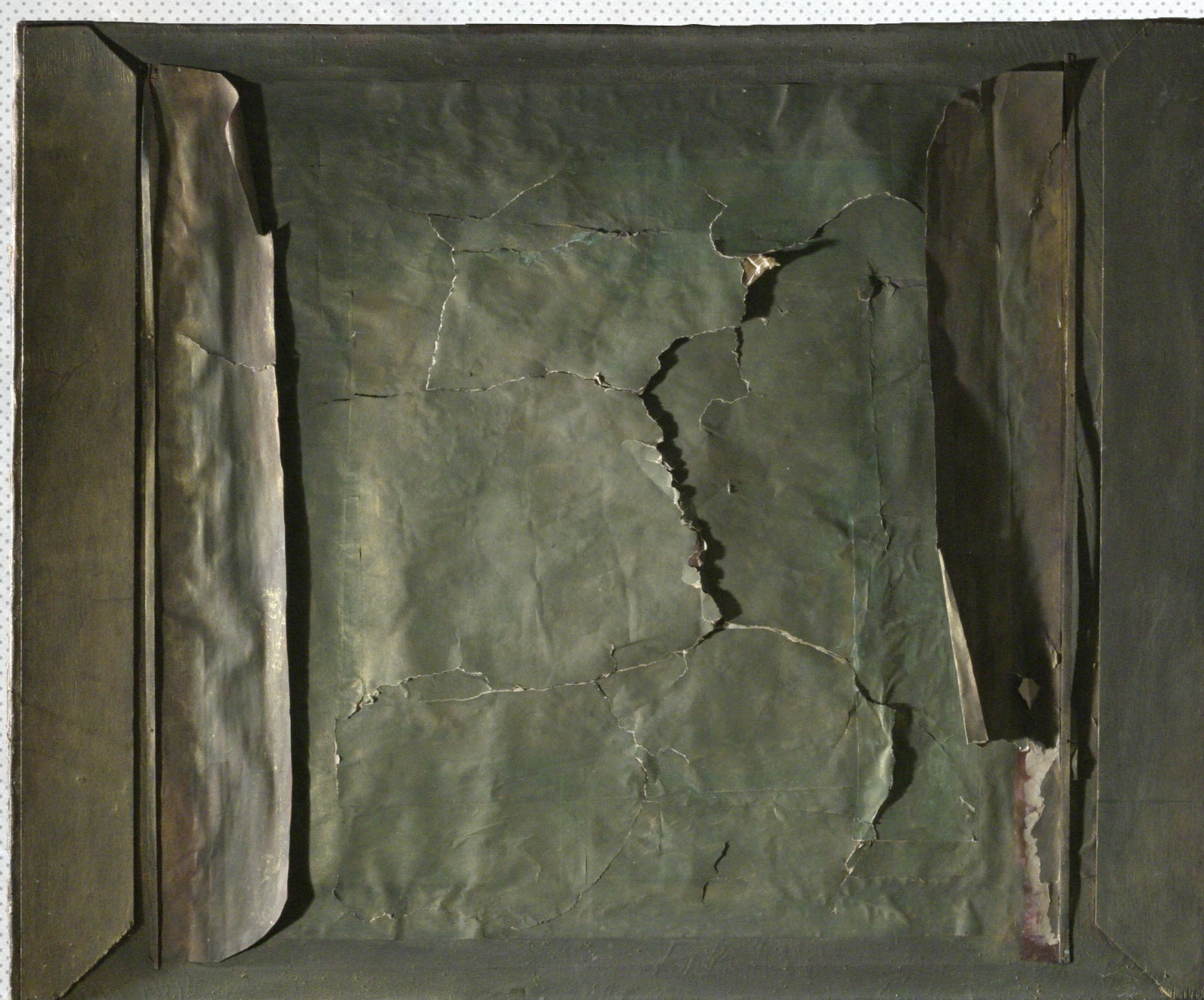
ill. 7. K. Zimblytė (KAZĖ). "The composition of the green". The canvas, paper, bronze paint, collage. 90 x 110 cm. Lithuanian Art Museum, inv. no. ED 170414. Collage before restoration. Typical conditions: spatial detail torn, deformed, pressed to the base, some fragments are missing. Painting in the central part of the paper severely damaged.

Restored details retouched with tempera and watercolor paints, mixed with bronze powder. In accordance with the works of art restoration ethical and aesthetic principles, restored fragments slightly different in texture and lighter compared to authentic.