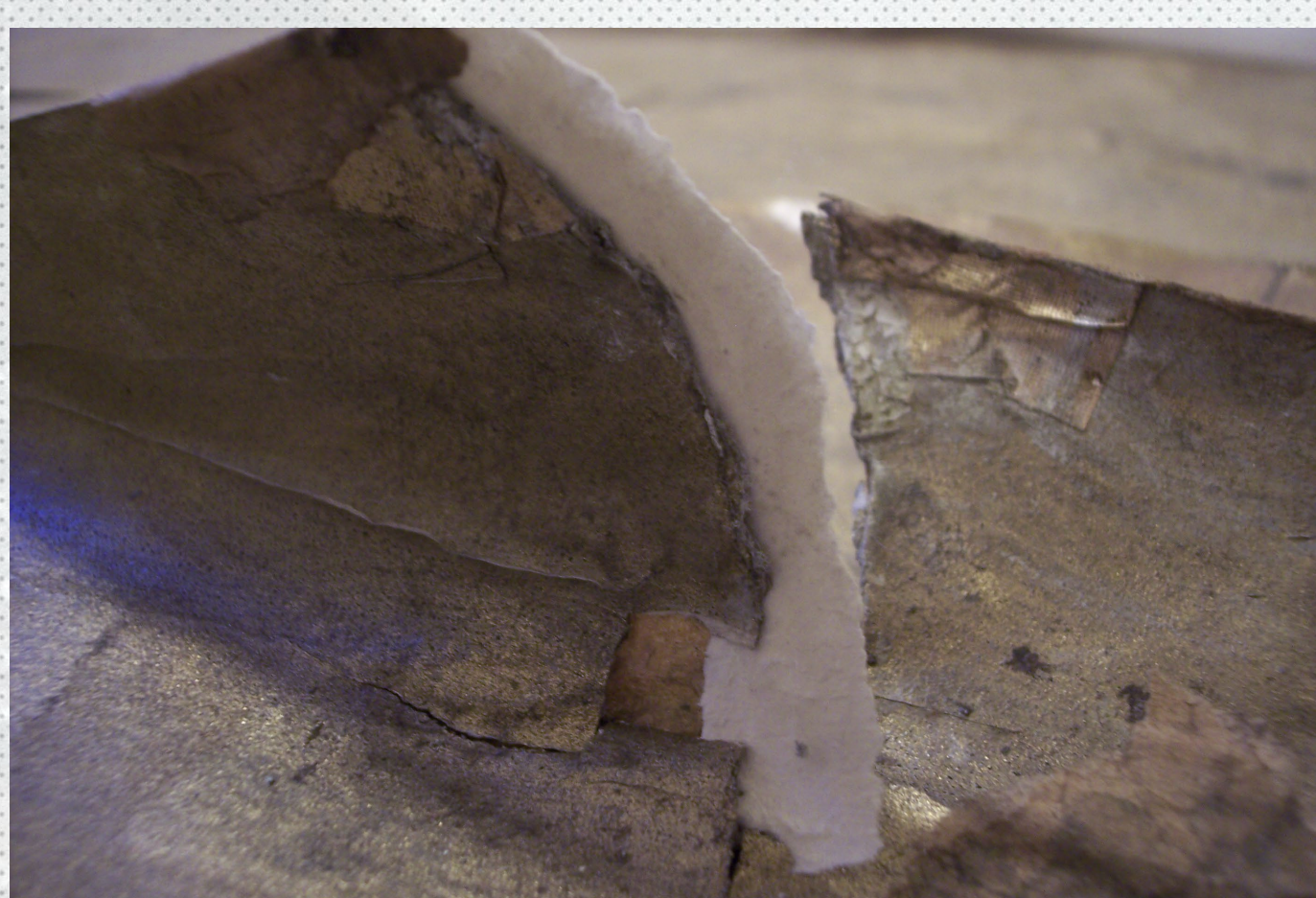
ill. 3. Fragment during the restoration. Spatial detail glued by inserting a rigid strip of paper.