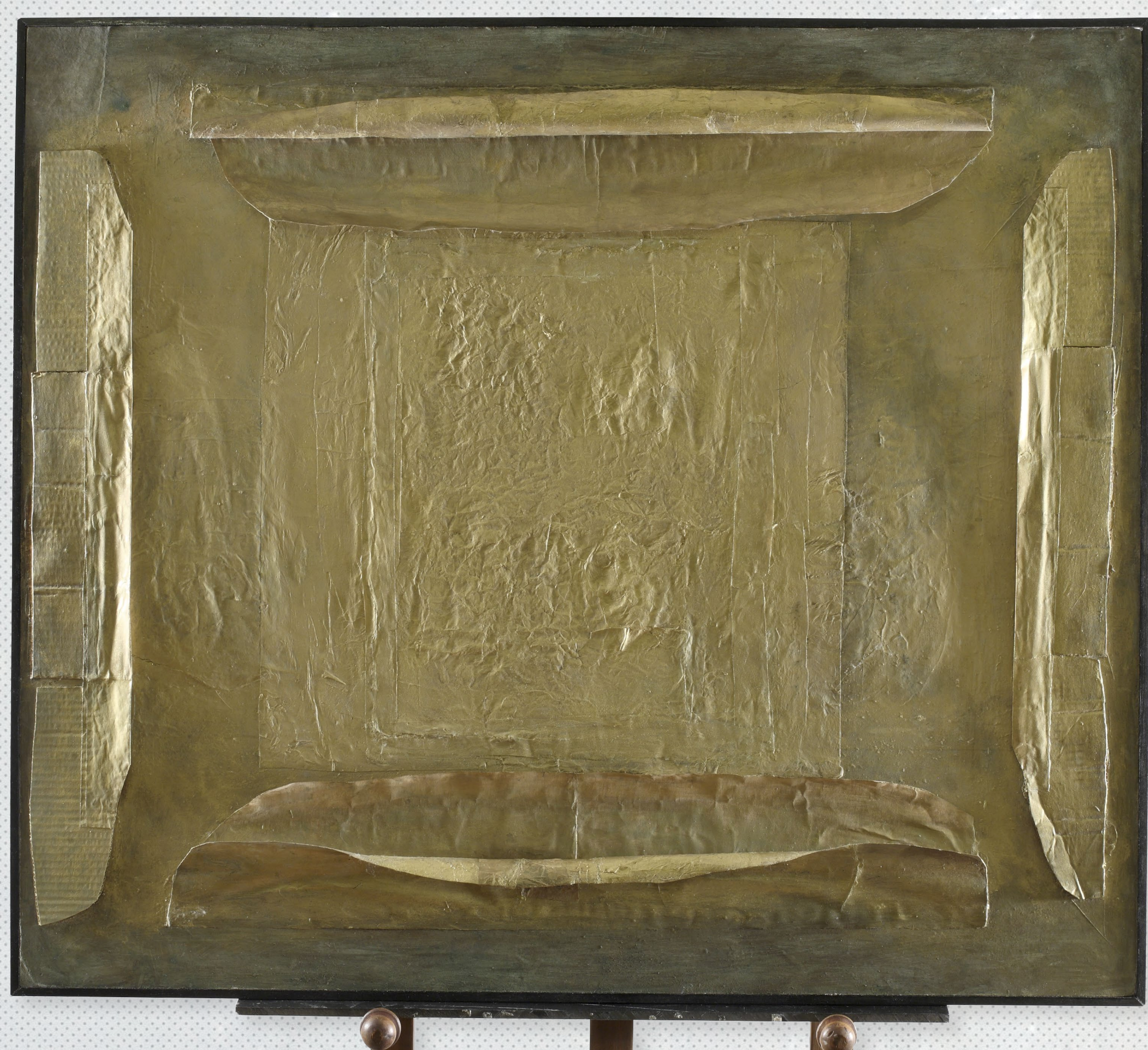
ill. 6. Collage after restoration.