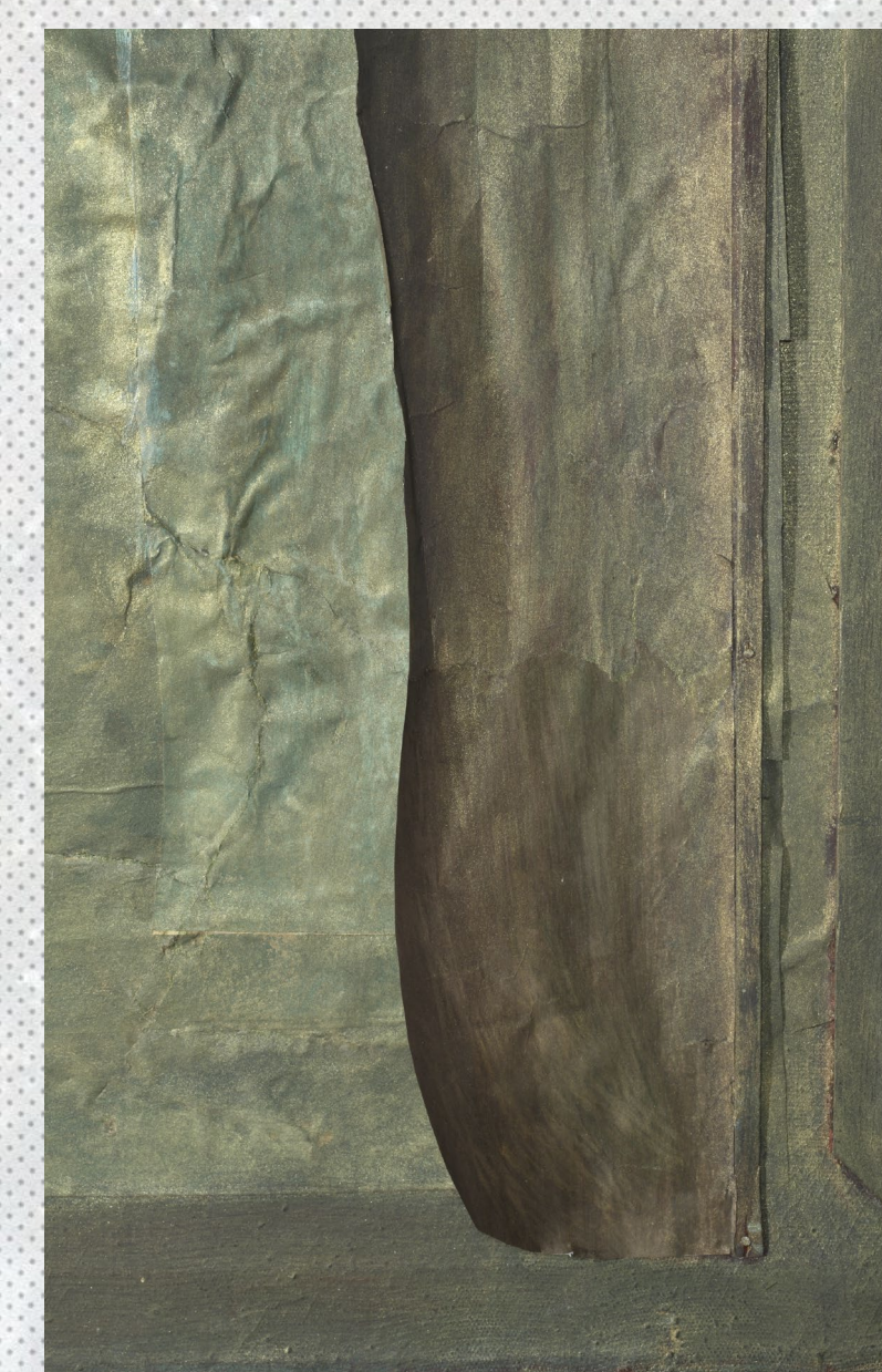
ill. 10. Fragment after the restoration.