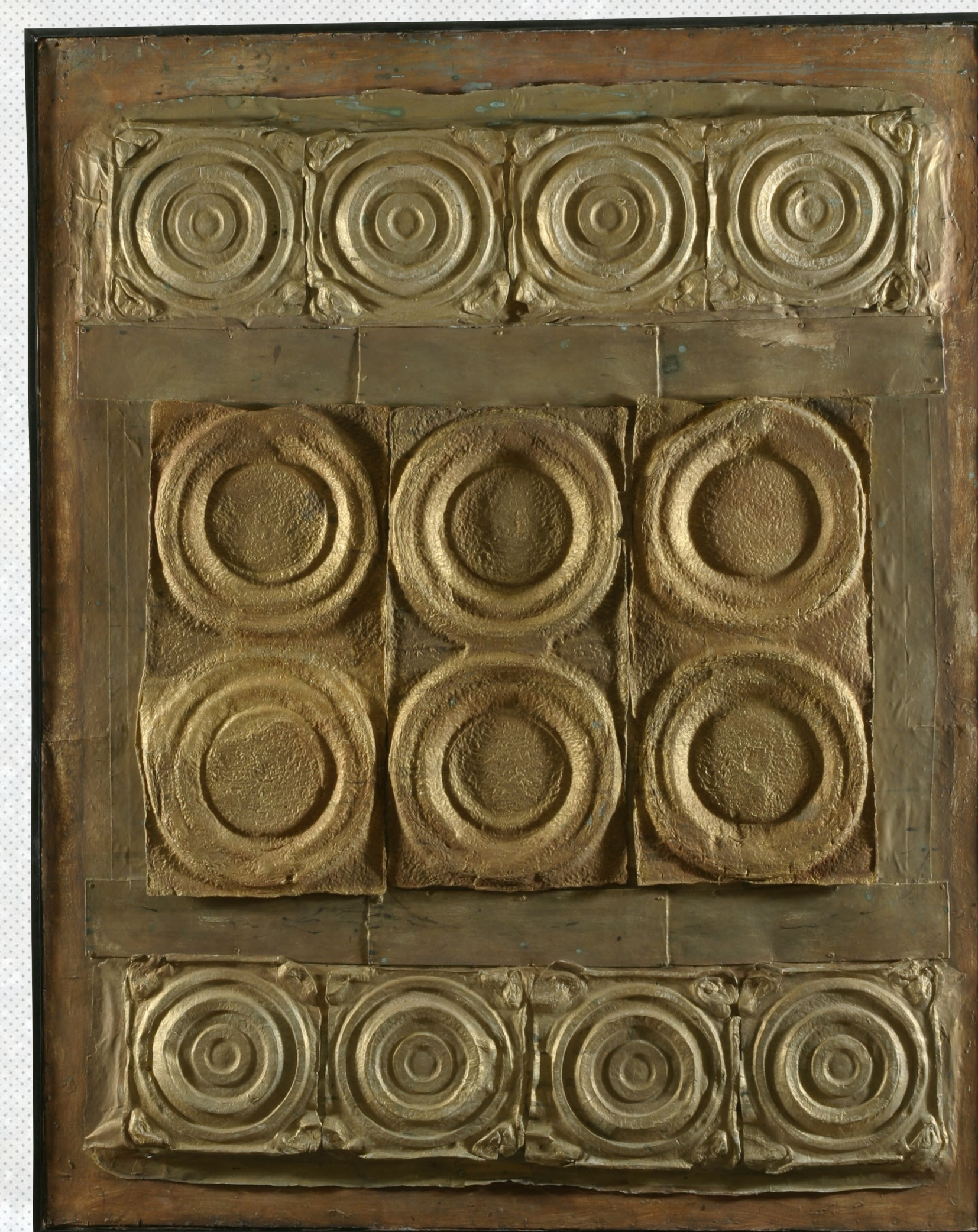
ill. 15. Collage after restoration.