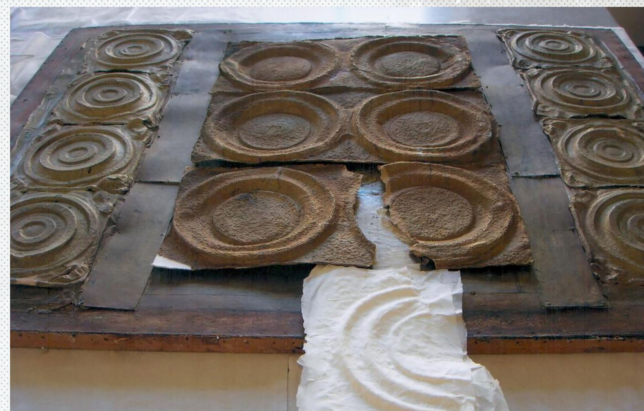
ill. 12. K. Zimblytė (KAZĖ). "The festival in Vilnius. Trumpeting". Cardboard, paper, bronze paint, collage, 130 x 102 cm. Lithuanian Art Museum, inv. no. ED 170438. Collage at the beginning of restoration.