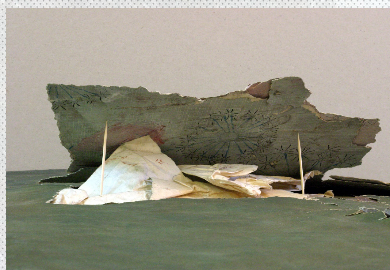
ill. 8. Collage fragment before restoration. Layers of paper in the damaged central part.