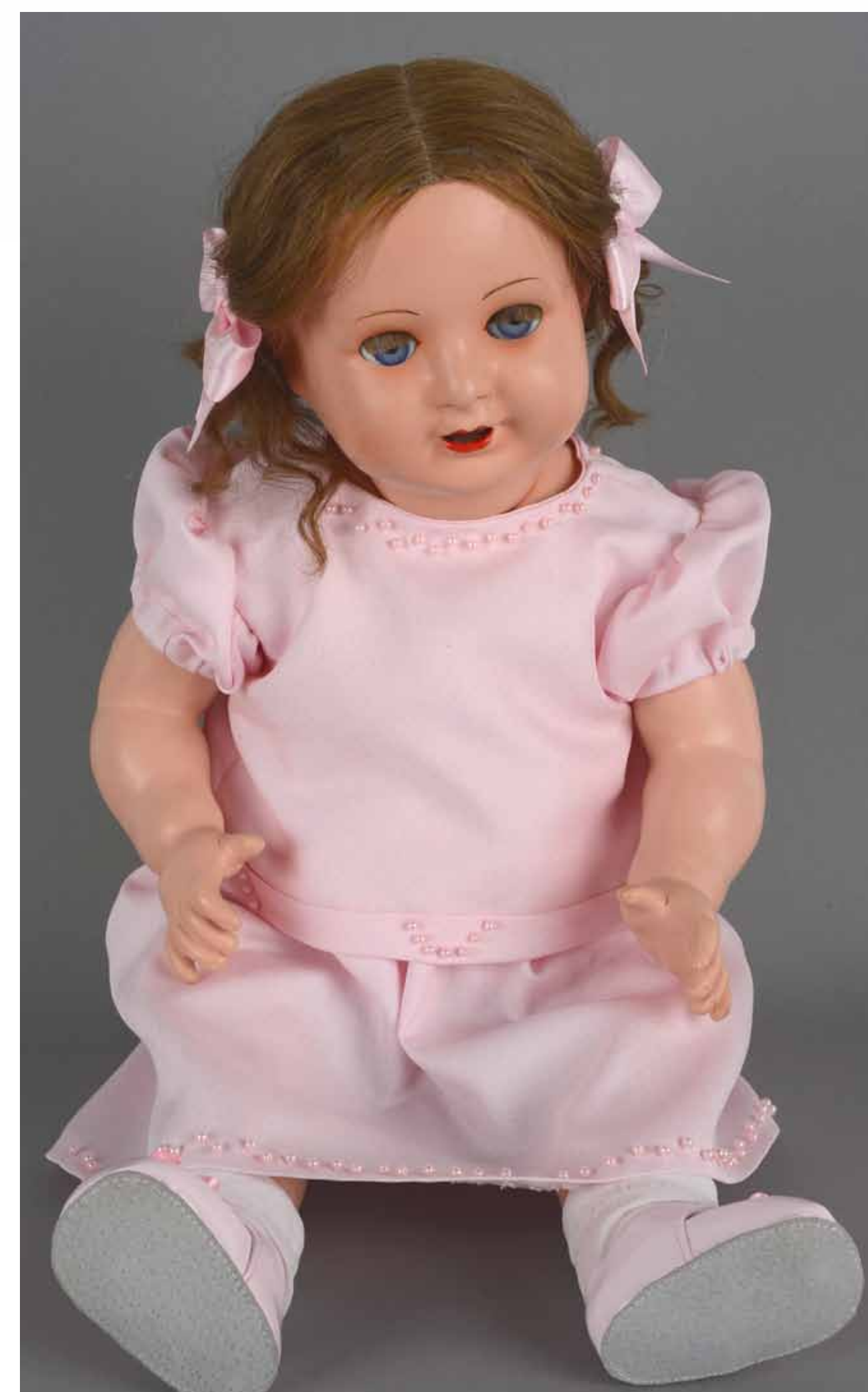
Fig. 2 Doll Tiiu after conservation that had been commissioned by its private owner.