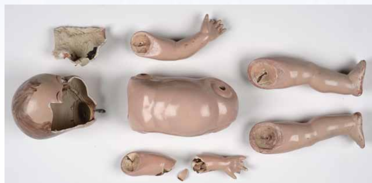
Fig. 3 The doll that belongs to the Estonian History Museum before conservation. The doll made of plaster mass had fallen down while the display was being prepared and broken into several pieces in the material of which were cracks. The eye-construction had disintegrated and both eyelids were damaged, one eye had lost its lashes. The tongue in the mouth had become loose and only an edge of a paper strip was still keeping it in place. The body had broken into eight pieces at the back. The right arm had a burn and two fingers were missing on the hand (earlier damages were left untouched). The arm had broken into two when it fell and there were loose fragments on both parts. Two fingers on the left hand were damaged and one finger was missing. The covering paint on the face, body, arms and legs had damages as well.

SA EVM Conservation and Digitalisation Centre Kanut, Estonia.