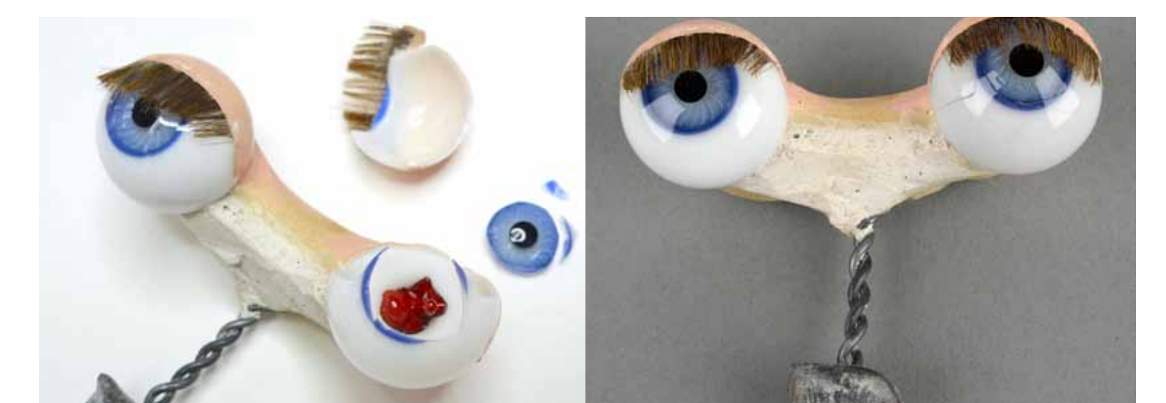
Fig. 9 In order to repair the eye construction the wig and the top of the head had to be removed. The eye was repaired with Araldite 2020 glue. The moving mechanism was set into its place and the piece of plaster fixing it was supported first from below with a strip of Japanese paper and then glued back.