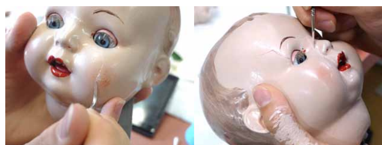
Fig. 6 The joining places and cracks were filled with toned priming of gypsum and chalk. When the filling had dried well, the surfaces were sanded down, toned and varnished.