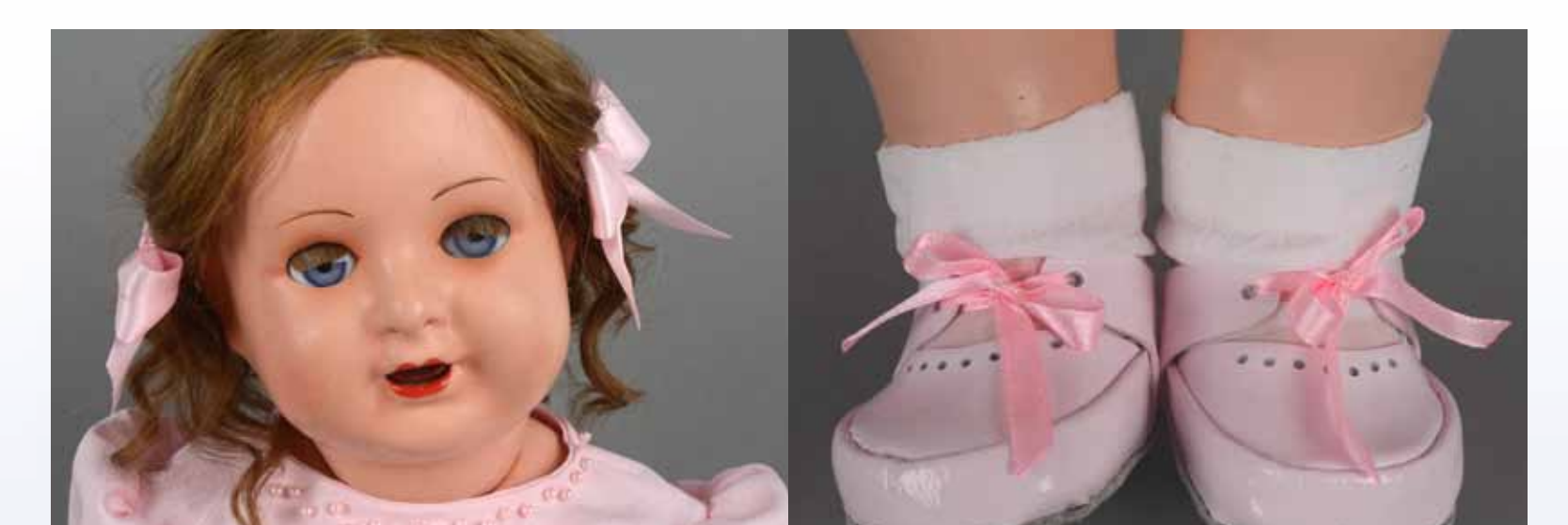
Fig. 13 The owner wished us to give the doll a hair-do and so the conservator's 'salon' gave it festive waves and curls, tied with two pink ribbons. The conservator also made a pair of pink patent shoes that matched with the new dress the owner made herself.