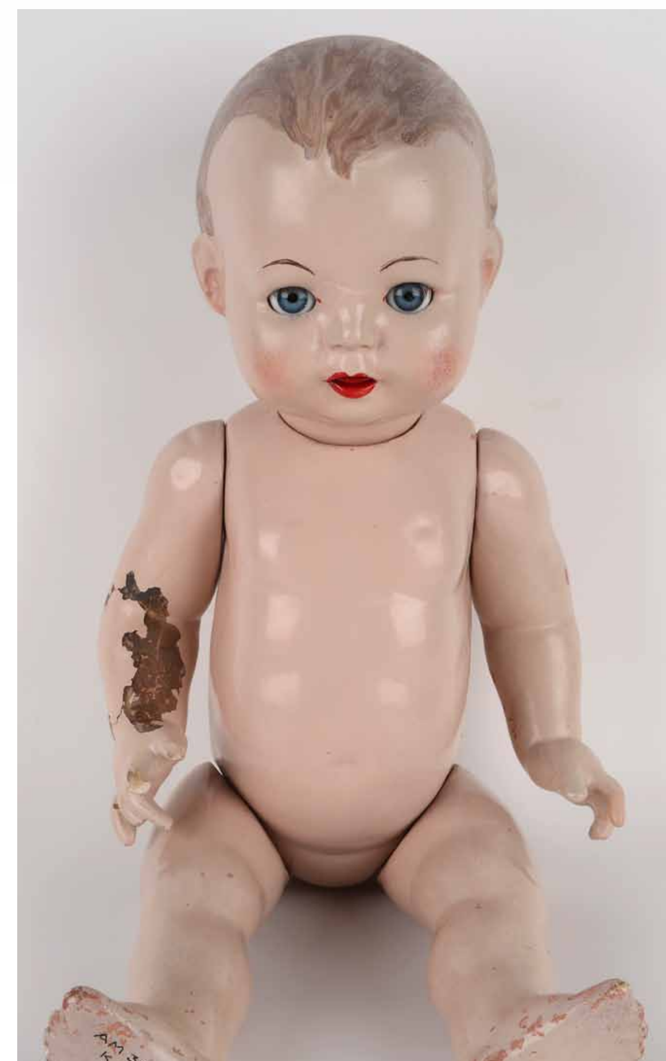
Fig. 1 An exhibit of the Estonian History Museum's display – State on Chessboard. The German Occupation in Estonia in 1941-1944 . The doll got fire damages in the Tallinn air raid of 1944. Here is the doll after conservation.