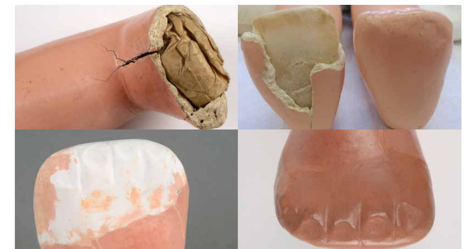
Fig. 10 The torn parts of the damaged foot and the cracks in the material were fixed and strengthened with Japanese paper. To restore the toe a strong base was made of thicker Japanese paper and PVA glue. This was layered with gypsum that was modelled after the other foot. Then it was covered with pastel-toned chalk mass and sanded down.