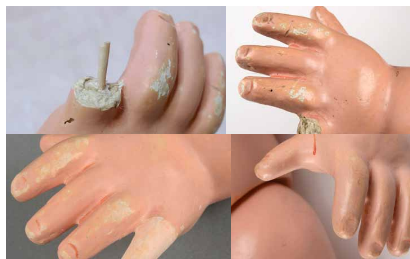
The goal of conservation quite often depends on the planned function of the object after conservation, on the storing conditions afterwards and, certainly, on the values of the item that should be retained above all. To illustrate the differences the present poster is dealing with two conservation assignments similar in form but different in their content. One of them is a doll that was to be displayed at the Estonian History Museum's exhibition – State on Chessboard. The German Occupation in Estonia in 1941-1944 . Another doll, called Tiiu had a great emotional value to the owner, who commissioned the conservation.

Differences in the conservation of the two similar objects are due to the different evaluation of them. For the first doll, a museum piece, the methods and materials were chosen mainly keeping in mind its historical value and topical connections that were to be preserved. The doll was a 'victim' of the air raid in Tallinn in 1944 and its owner's personal memories of the event made it a suitable illustrative exhibit. In case of doll Tiiu in private ownership, it was important to consider the future function as a toy, respecting also the owner's sentimental remembrances of its looks.