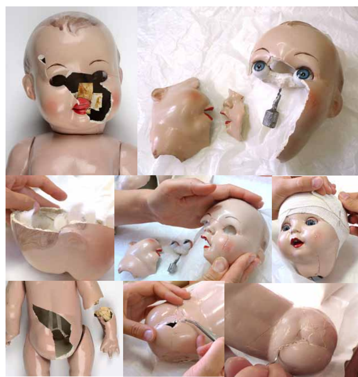
Fig. 4 The loose fragments of the head, body, arms and hands were joined with a bridging method, first using PVA-glue and Japanese paper on the edges of the fragments and then the glue Acronal that can be brushed on the contact surfaces in a rather thin layer.