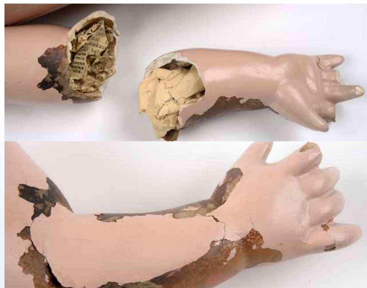
Fig. 7 The heat damage on the arm was left untouched, as it had contextual and topical value.