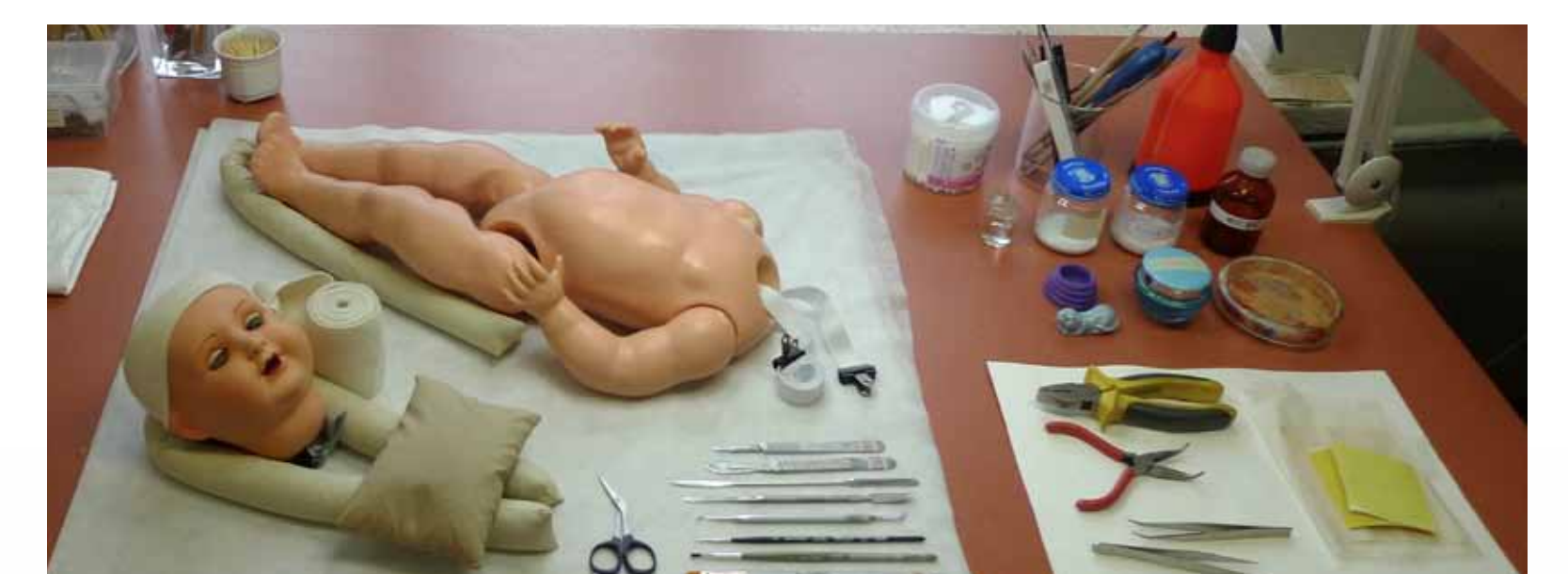
Fig. 12 Reassembling of the doll. Inside the doll, the arms were connected with elastic ribbon first, after that legs and the head were connected with each other forming an elastic ribbon triangle inside the body. In order to get the ribbon through the body a wire loop was made and used. The ends of the elastic ribbon were fused with a lighter to prevent them from unravelling. The hair was glued on the head with a mixture of PVA glue and wheat-starch. It was dried under slight pressure.