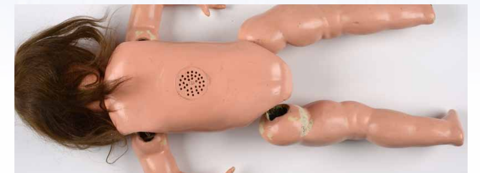
Fig. 8 Mixed-mass doll Tiiu before conservation. The elastic band connecting the parts of the body had stretched and all the limbs were hanging down. The left glass eyeball had a broken iris. The doll was covered with dust and its hair was dirty and tousled. The ball of the right foot and the little finger of the left hand were missing. The contact surfaces of limbs and body were worn or broken and some insect damages occurred in the material.

PVA glue (Estonia), acrylic glue Acronal (Kremer Pigmente, Germany), two-component epoxy resin Araldite 2020 (Kremer Pigmente), isopropyl alcohol, tri-Ammonium-citrate, detergent Villašampoon (Estonia), wheat-starch, Japanese paper (11 g/square cm and 60 g/square cm KOZO; Japan), gypsum, chalk, MAIMER Readymade colours (Kremer Pigmente), white spirit, semi-matt varnish (AS Vunder).